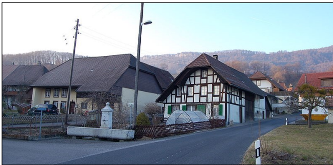
Rumisberg, Canton Bern, Switzerland, Population: 488 Heimat of the Boesiger Family

One also finds the name Biesinger (or some variant) in the Mornington area, but they are neither Mennonite nor Amish and probably have no connection to the families here described.